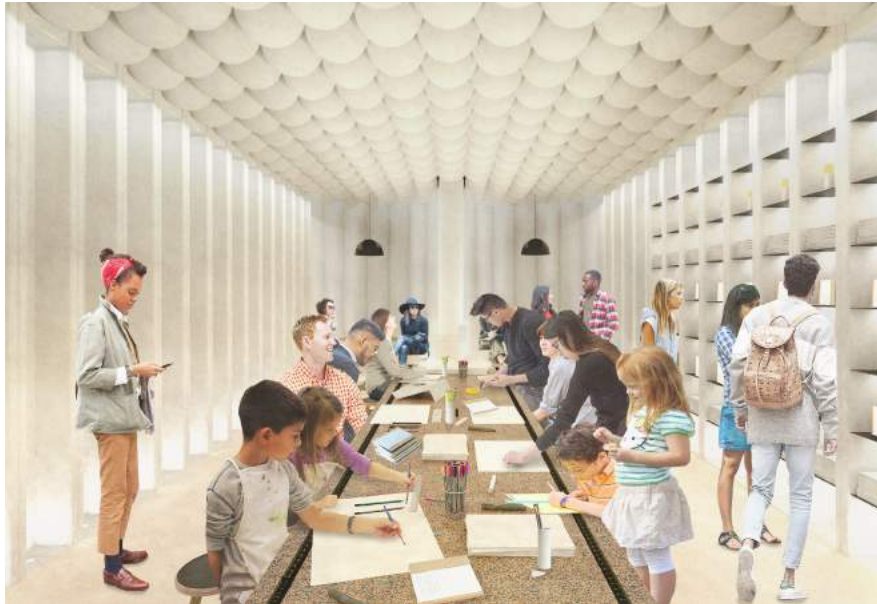
The Designers' Dreamscape by Squire and Partners

The Experimental Perfume Club will run a series of workshops in connection with its new Layers collection - visitors will learn about the ingredients used and blend their own fragrance with founder and expert perfumer Emmanuelle Moeglin.