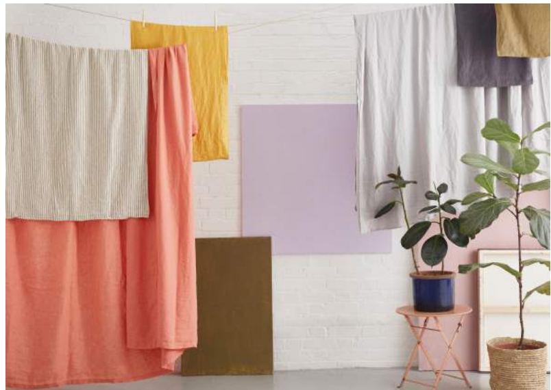
From left: Ultima Thule by littala and coloured stonewashed linen by Deco Collective

ELLE Decoration will organise a special 'Shopping Weekend' for its readers visiting the show on Saturday 22 and Sunday 23 September. A selection of design and lifestyle