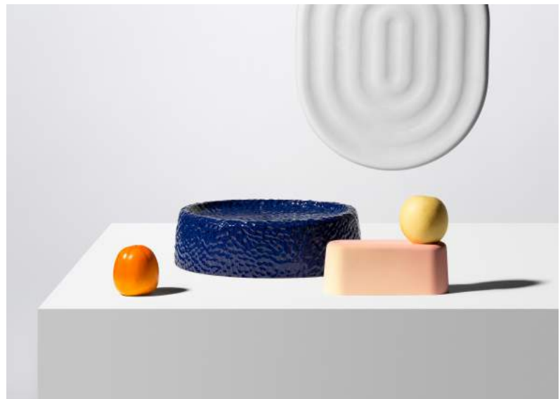
Left: Little Sister by SUPERLIFE | Above: VPT&C ceramic collection by Dimitri Bähler