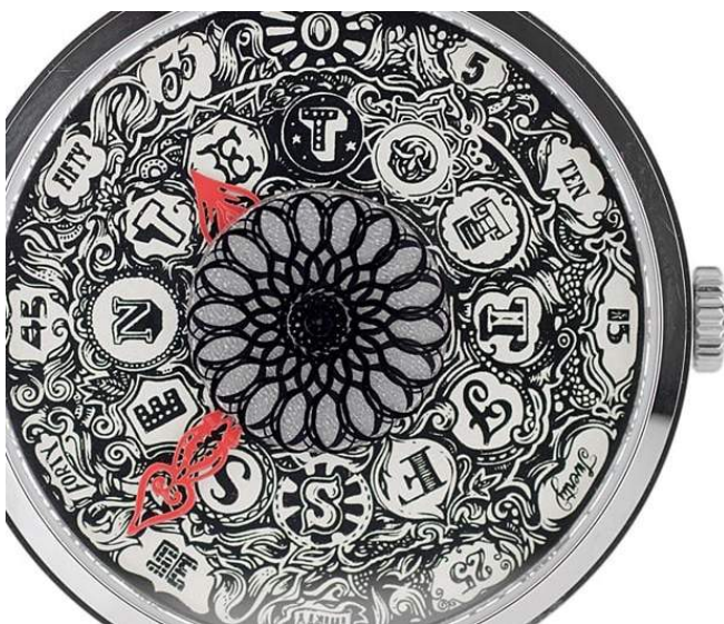
Mr Jones watches

Visitors can expect product launches, workshops and open studios at designer-maker enclave Oxo Tower Wharf . Japanese design shop, Wagumi , has invited wood carving artist Kunimitsu Takatsuki over especially for the London Design Festival. Takatsuki will provide pop-up demonstrations and workshops. Artist collective Skylark Galleries 2 will host a range of workshops and talks on various topics including printmaking. Archipelago Textiles will give visitors the opportunity to experiment with weaving, colour, texture, mood-boarding and try out a mini loom. A number of designer makers will launch new products including a custom colour service from lighting designer Innermost , 'Fluidity' jewellery collection by JeDeco and the unveiling of a new watch by cult watch brand Mr Jones Watches . Oxo Tower Wharf will also welcome three new designer makers in time for designjunction , Lyte Ltd , MOXON London and Noodoll .