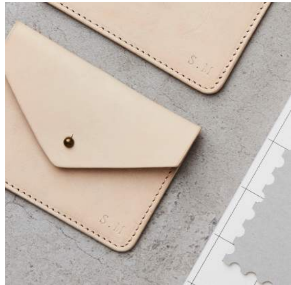
Personalised stationery and accessories by Katie Lemon

MONC will be offering free personalisation and monogramming on their made in England glasses cases at their stand. Using a vintage Kingsley hot foil embossing machine, each case will be stamped with classic gold, silver or nude lettering. Their beautifully crafted cases are handmade from vegetable tanned leather.