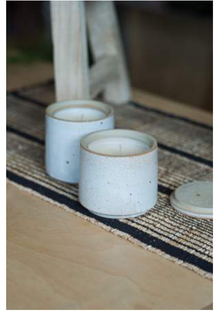
New travel-inspired candle collection by Earl of East London