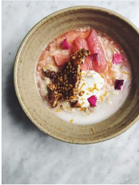
Left: 26 Grains at STILL BY FORM | Below: detail of The Glenlivet bar by Bethan Gray