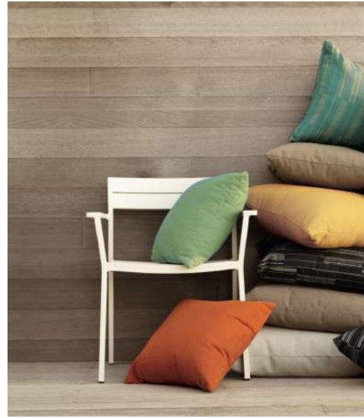
From left: Picnic table and Eos lounge chair by Case Furniture

At designjunction , Swiss Design Council Pro Helvetia will introduce the best in contemporary Swiss design. The exhibition – Design Switzerland – will feature seven emerging design studios and will display a wide range of projects, from a household composting system by WormUp GmbH to minimalistic sport equipment by Ulysse Martel. The exhibition will also showcase innovative accessories developed in Greenland by Hors Pistes, an interactive LED lighting installation by iiode, contemporary homeware pieces by SUPERLIFE as well as a series of minimal everyday objects by Dimitri Bähler Studio. Combining innovation, high quality and longevity, the projects selected are ingrained in Switzerland's craft heritage while challenging the traditional production methods.