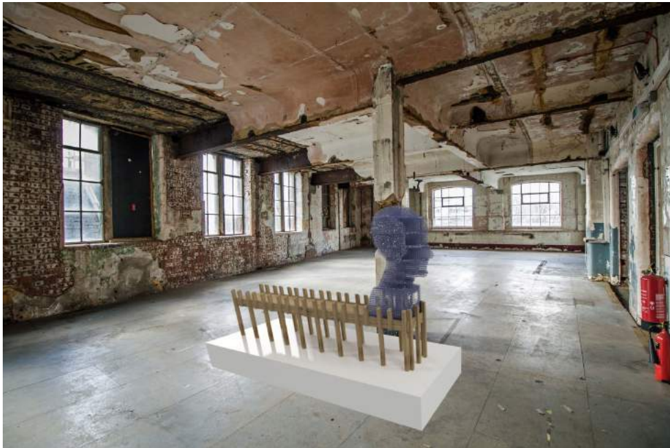
3D printed 'Head Above Water' by Stuart Padwick and 3dpeople

The main piece on display will be a two-metre high 3D printed 'Head Above Water' sculpture by 3dpeople. The 'Head' will be created using a generated algorithm representing the synapses of the brain in a mesh material.