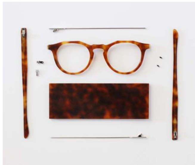
Made in England glasses case and glasses by MONC

For its first appearance at designjunction , Earl Of East London will be transforming its stand into an immersive Japanese spa installation to launch the new travel inspired fragrance collection. Complete with pine cladding and folding screens, the new line will be showcased within the minimal design aesthetic of Japan. The space will be scented with “Onsen” using ultrasonic diffusers, and there will be traditional Japanese Onsen music and Green tea by Tiosk available to enhance the multi-sensory experience.