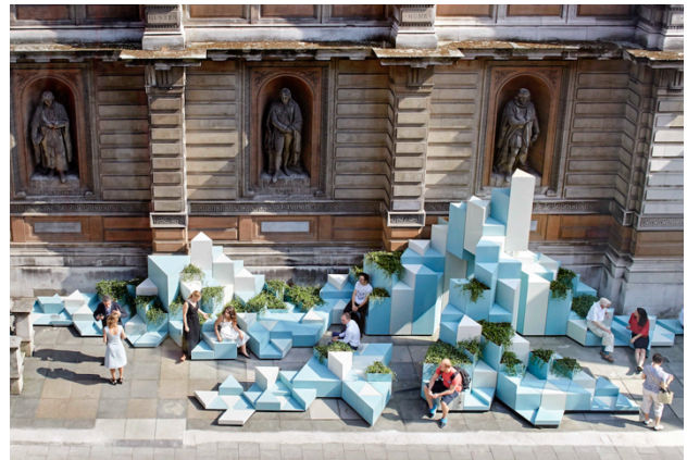
Cubitt House at designjunction 2016 and Unexpected Hill by SO? Architecture and Ideas, Commissioned by Turkishceramics and Royal Academy of Arts.