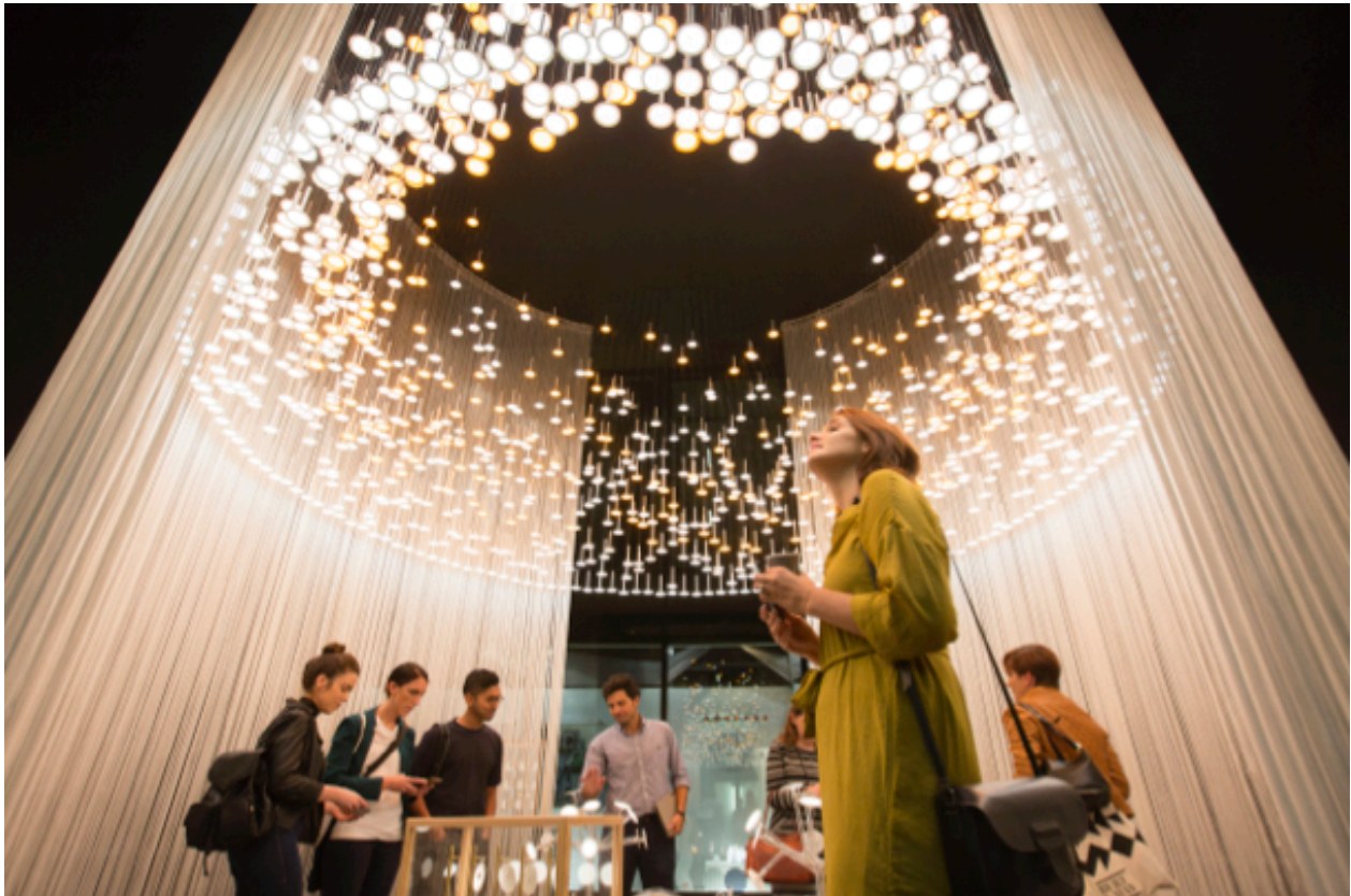
Blackbody at designjunction 2016

designjunction returns to the spectacular King's Cross site in September (21-24 September) for this year's annual London Design Festival. Following the success of the 2016 edition, which attracted 27,000 visitors over five days, designjunction will expand across new King's Cross locations for its flagship London show.