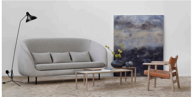
Icons of Denmark and Fredericia

Lightjunction - the decorative lighting section - returns with a curated mix of leading global lighting firms. Since its inception, lightjunction has attracted world-class brands including Artemide, DCW Èditions, FontanaArte, Marset, Northern Lighting, Örsjö and Slamp.