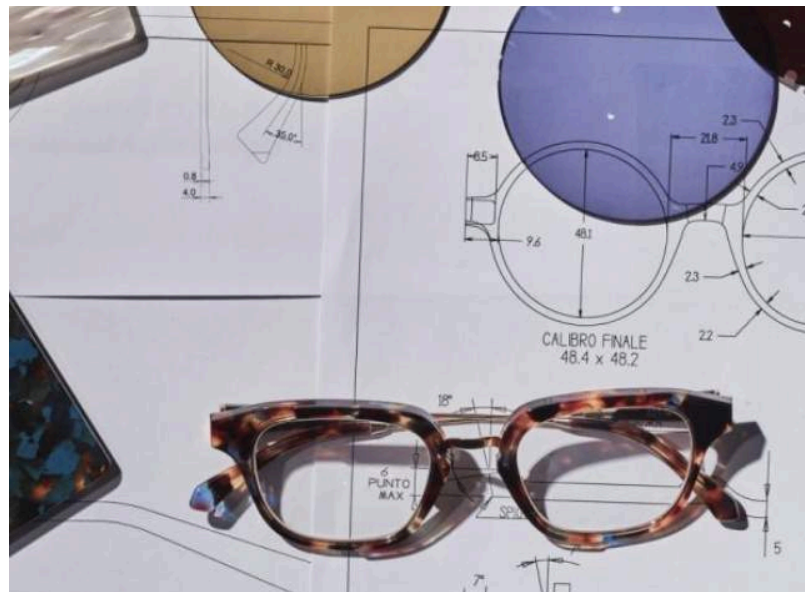
Above: London-based eyewear brand Kite

Innovative London-based eyewear brand Kite has partnered with celebrated designer Benjamin Hubert to launch a revolutionary technology system, bringing a new level of customisation to the world of premium eyewear. Set to radically transform the traditional eyewear buying experience, the new system will enable Kite to create bespoke frames which are mapped to the unique features of the individual.