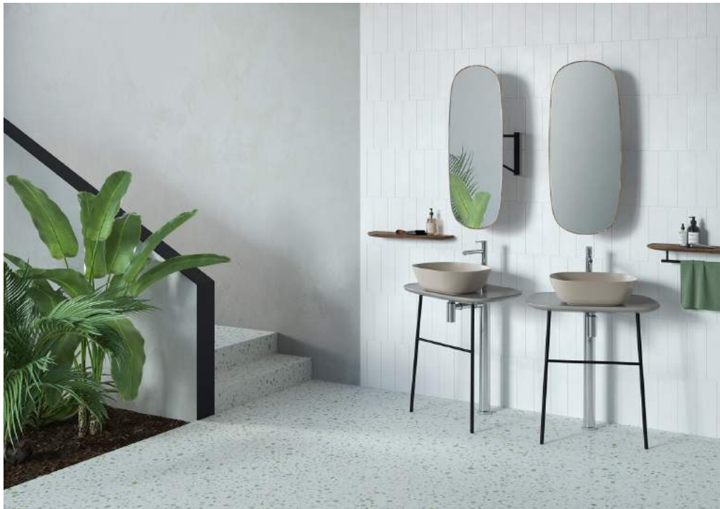
Above: Plural collection designed by Terri Pecora for Vitra

bathing spaces and rituals, the range introduces the bathroom as a social hub and informal living environment where people meet and reconnect with themselves and their family.