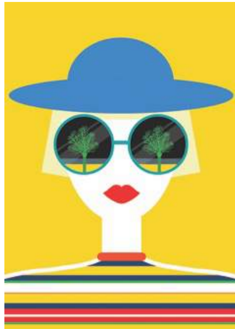
Above: Radio and Sunglasses posters, East End Prints

Billy Tannery , a British micro-tannery specialising in sustainable leather goods made from goat hides (a by-product of the food industry) will launch a special collaboration with shoe makers Crown Northampton. Billy Tannery's full range of leather goods including Backpack, Gote Bags, Briefcases and Cardholders will also be on display.