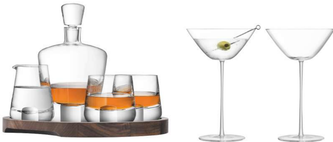
Above: Whisky Cut and Bar Culture collection, LSA

including Bar Culture, a collection of contemporary mouthblown designs for the luxury bar and Whisky Cut, a refined range of tumblers with hand cut decorations.