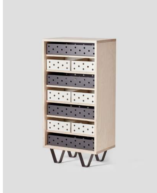
Above: Canteen utility chair and Sled drawer unit, Very Good & Proper

Swedish lighting company Wästberg will present its new w171 alma pendant light. Formed of delicate concentric circles, the lamp diffuses a rounded source of light while reflecting soft waves of shadow onto the ceiling.