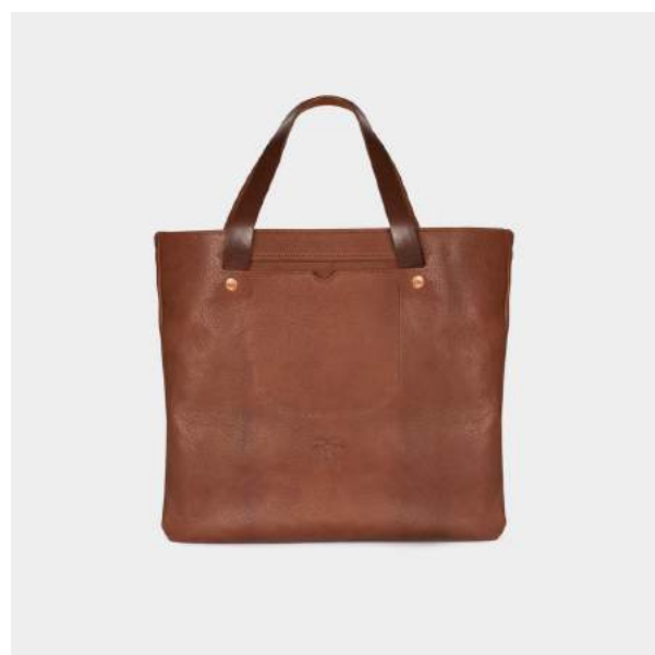
Above: Backpack and Gote bag in chestnut, Billy Tannery