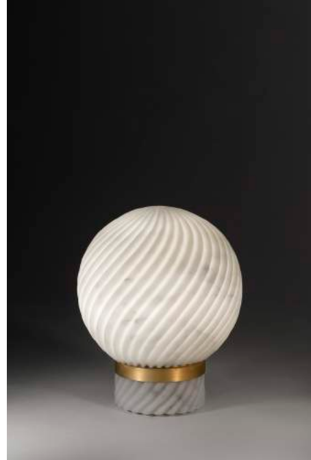
Above: Victoria lighting collection, Bethan Gray