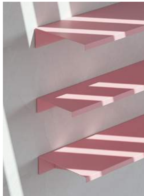
Above: December side table and Apex shelves by New Tendency

Also new to the show this year, Broste Copenhagen will bring its Danish design heritage and craftsmanship expertise to London with the new modular Lake sofa, its core collection of upholstered furniture and extensive range of home accessories including a new series of ceramics.