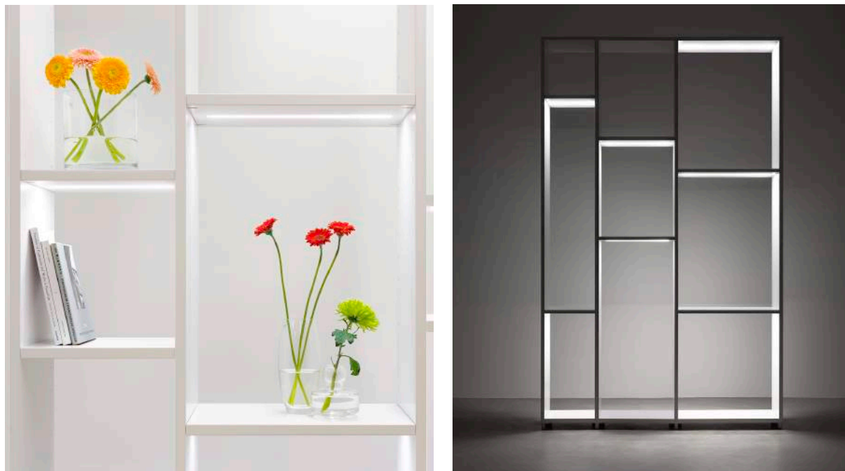
Above – KIVA shelving system

Finnish furniture brand KIVA will launch a fully customisable shelving system featuring easy tool-free assembly and integrated lighting. The new KIVA shelving unit combines the flexibility of personalised dimensions with patented push-n-lock system and built-in low-voltage lights.