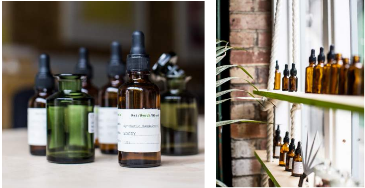
Above: Experimental Perfume Club

The Experimental Perfume Club , a micro-perfumery launched by scent expert Emmanuelle Moeglin and specialising in bespoke perfume creation for both the individual and brands alike, will devise an access-all-areas fragrance laboratory featuring the brand's latest blends.