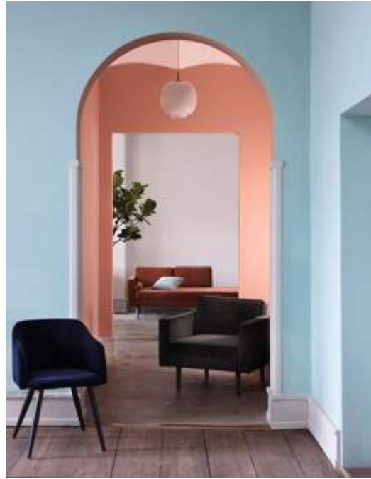
Above: ceramics and upholstered furniture by Broste Copenhagen

New lifestyle brand, Northern will be unveiled at designjunction with several new launches including the Shelter desk, Oasis planter and Case cushion. Born out of Northern Lighting, Northern has now extended its trademark style to furniture pieces and interior accessories bringing fresh vision and Nordic spirit to its new collections.