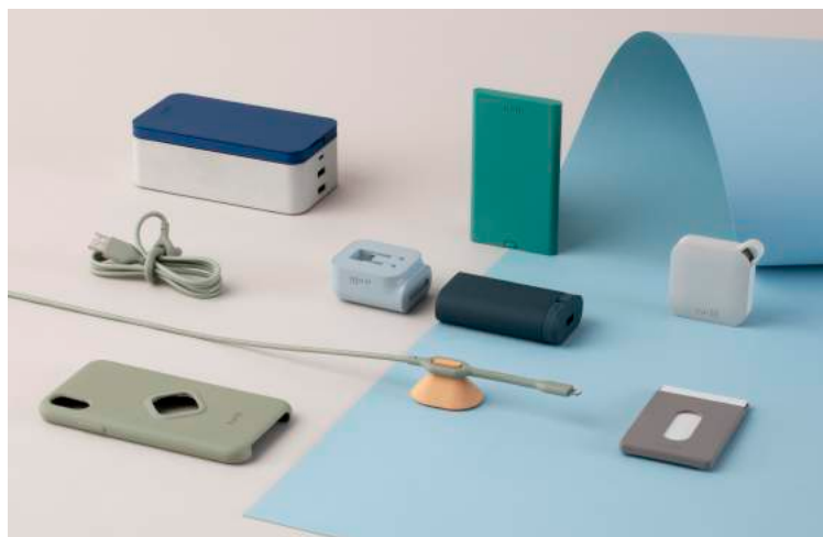
Above: Tech accessories from Nolii