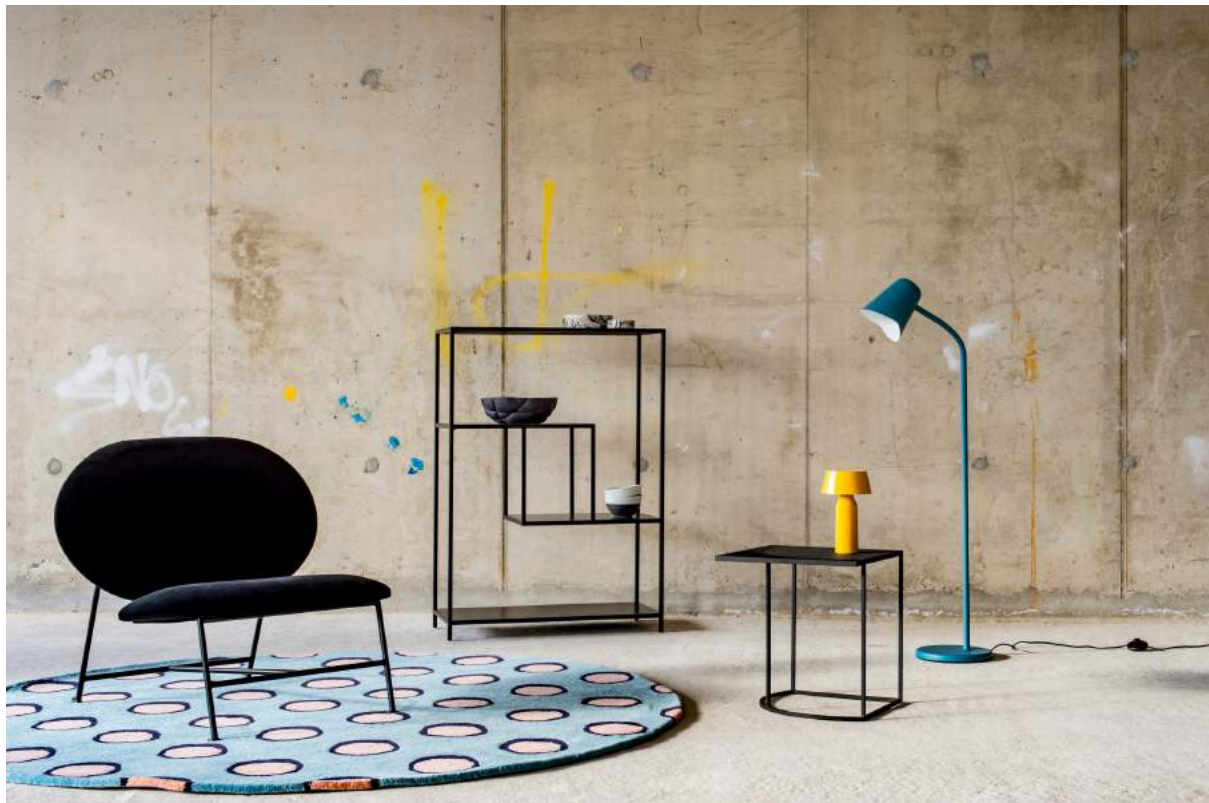
Above: Northern, Broste Copenhagen, Pelican Story, Marset

JUNE 2018: PRESS RELEASE #LDF18 #designjunction