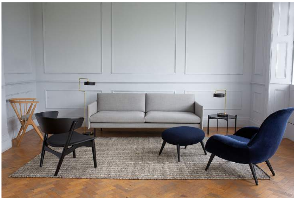
Above: new Form sofa collection, Icons of Denmark

designjunction will see the official launch of the Form sofa family, the latest collection by Icons of Denmark . Bringing Danish design to the UK, the brand will also unveil a new one-seater booth responding to the needs for flexible, but private office furniture solutions.