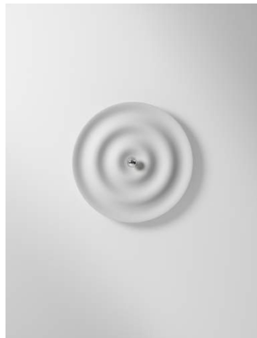
Above: w171 alma light, Wästberg