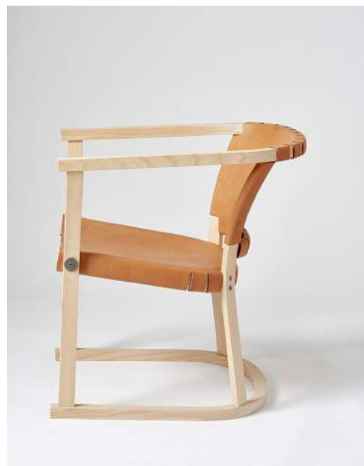
Above: Nordic and T13 chairs, Gemla