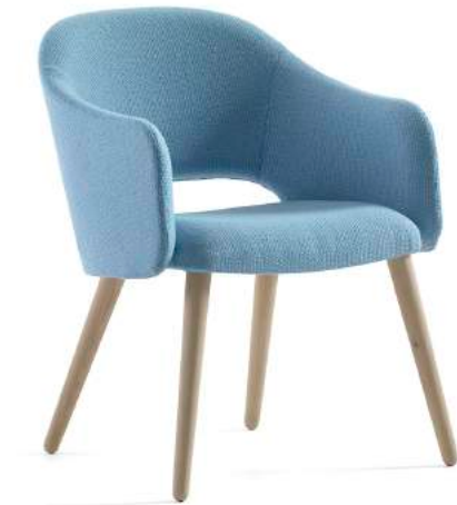
Above: Norma sofa and armchair; Ester chair, Johanson