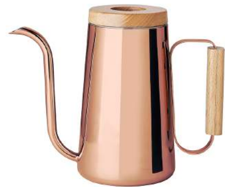
Above: MaakLab soap range and Toast Living kettle, Notable Designs